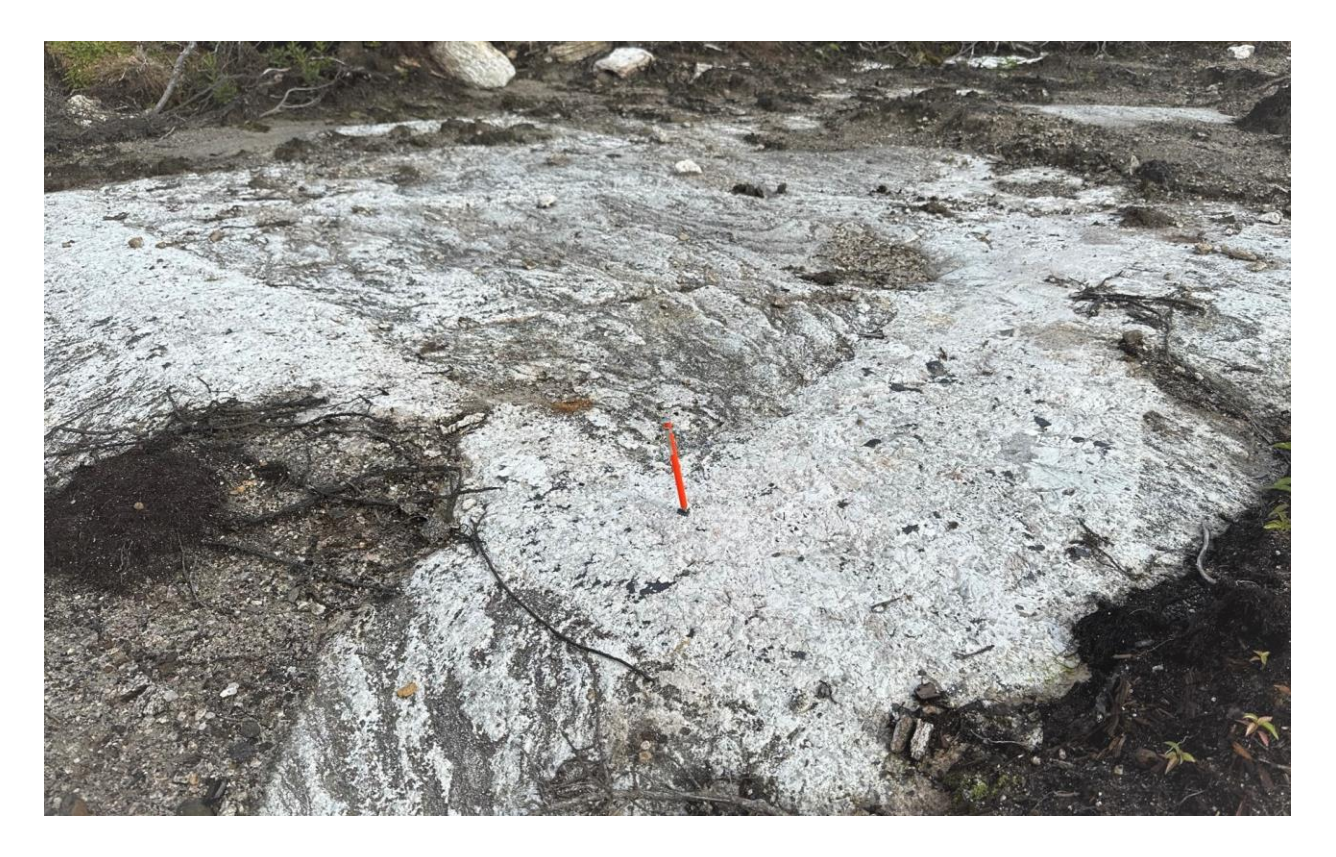
Figure 3: Magnetite rich pegmatite body containing a large piece of basement gneiss

Figure 3 is a photo of a several metre wide angular block of basement gneiss contained within a large pegmatite body on the Ernest property. This feature may be a rim zone result of the Manicouagan impact event. The crust (basement gneiss) was melted for several thousand metres at the centre of the impact but the rim zone would have been intensely fractured and broken. The volatile phase, a combination of the melted meteor and crust material, would have been injected into the fractured rim zone. This may be a picture of the resulting chaotic lithologies.